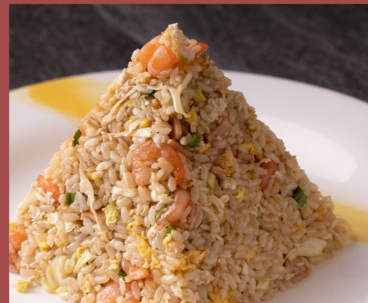
天悅海陸蔥香炒飯 Skylark Fried Rice with Ham and Seafood

所有價格需外加10%服務費 All prices are subject to 10% service charge