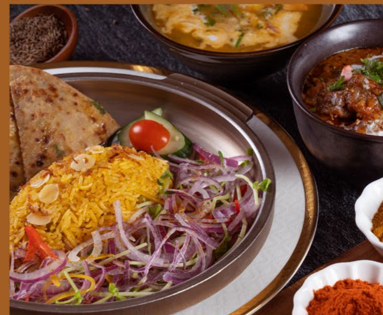
印度咖哩飯 Traditional Indian Curry