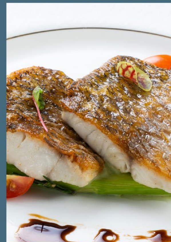
香煎鱸魚烤時蔬 Pan-fried Sea Bass with Truffle Sauce