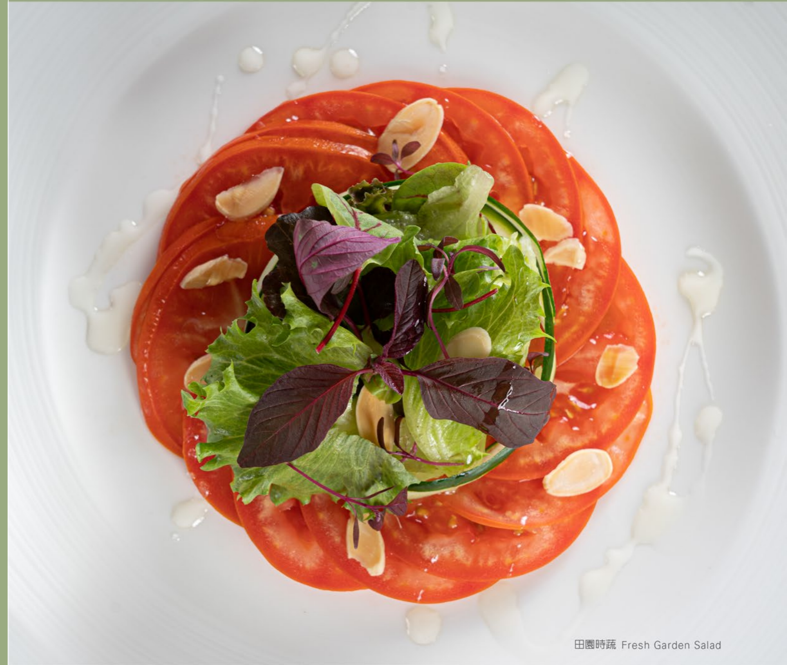
田園時蔬 Fresh Garden Salad

所有價格需外加10%服務費 All prices are subject to 10% service charge