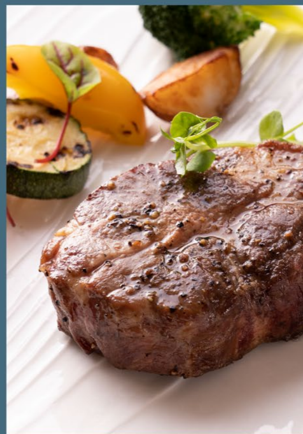
伊比利豬肉 Grilled Iberico Pork