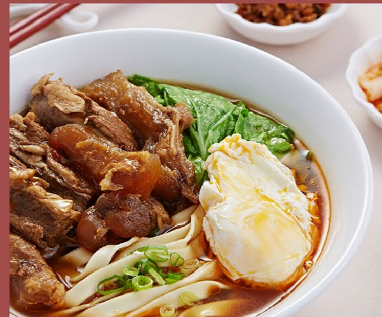
台北紅燒牛肉麵 Taipei Braised Beef Noodle Soup