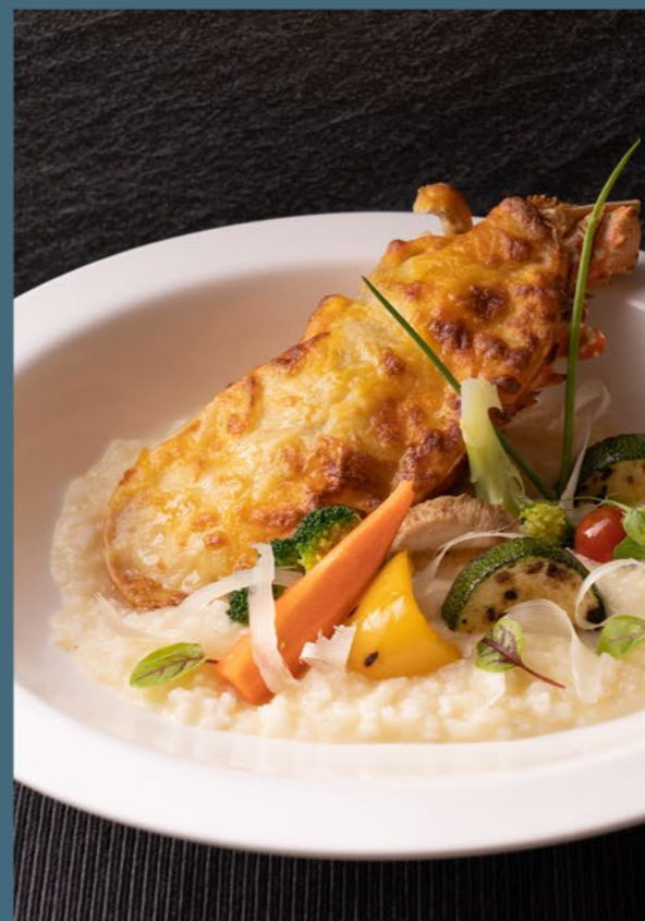
焗烤龍蝦佐起司燉飯 (半尾) Baked Half Lobster with Risotto

所有價格需外加10%服務費 All prices are subject to 10% service charge