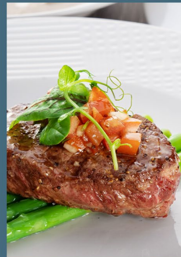
美國菲力牛排 Grilled Beef Tenderloin