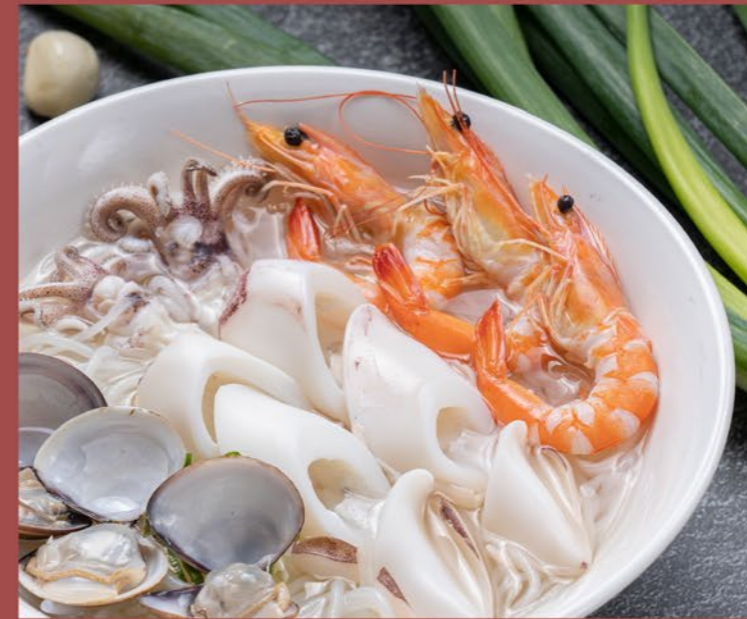
台南小卷海鮮米粉湯 Tainan Rice Noodles Soup with Squid