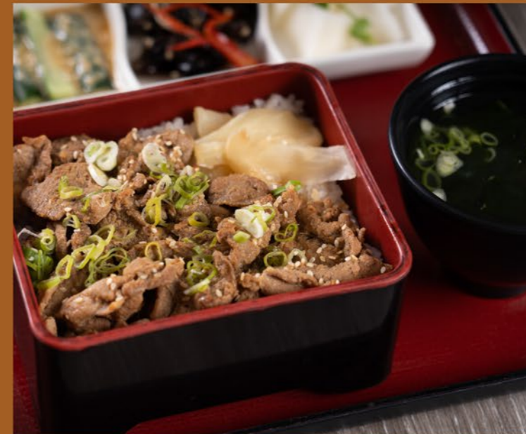
薑汁豬肉飯 Pork Rice Bowl with Ginger