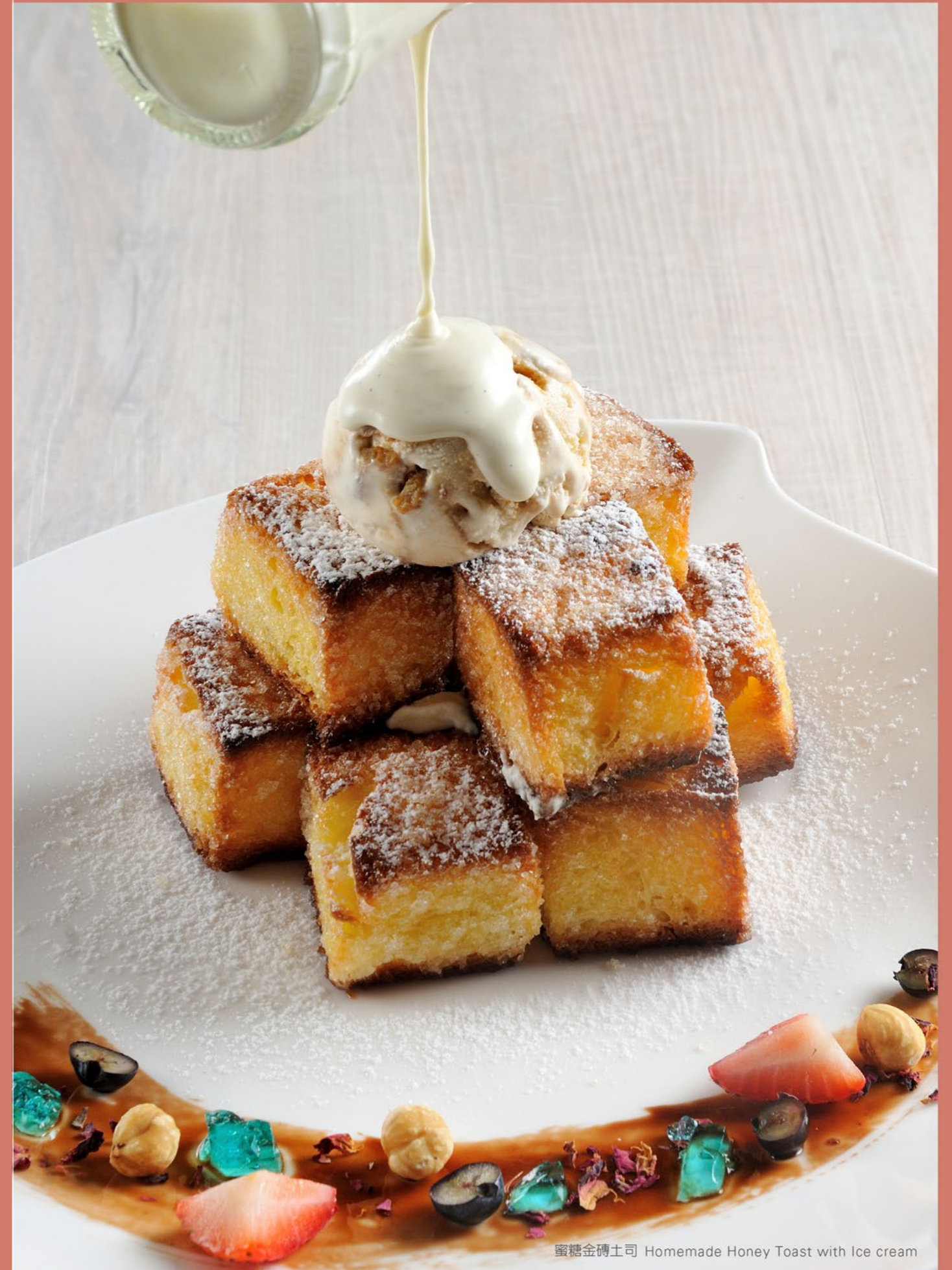
蜜糖金磚土司 Homemade Honey Toast with Ice cream

所有價格需外加10%服務費 All prices are subject to 10% service charge