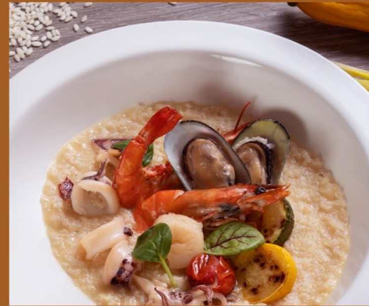
海鮮燉飯 Seafood Risotto

所有價格需外加10%服務費 All prices are subject to 10% service charge