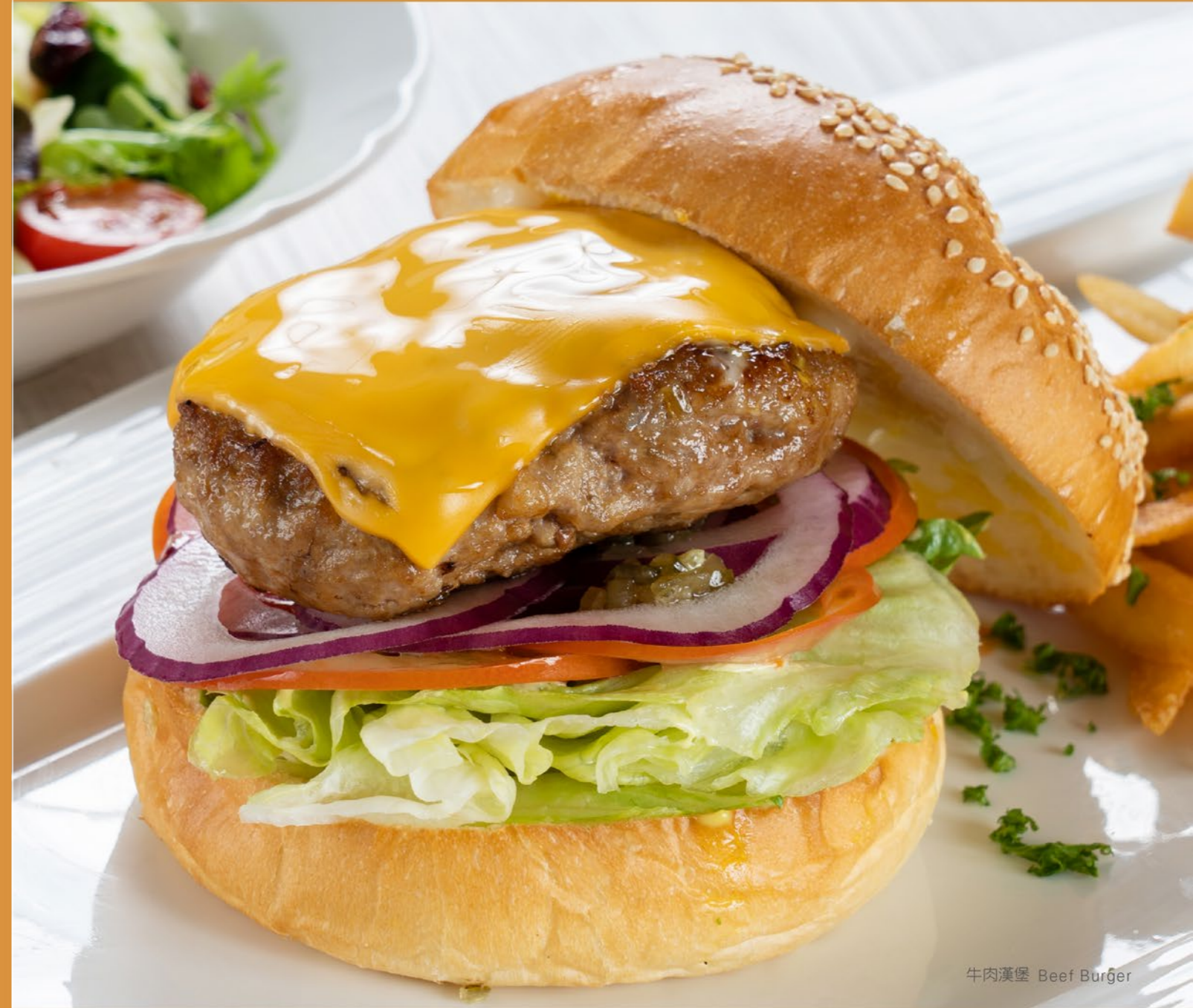
牛肉漢堡 Beef Burger

所有價格需外加10%服務費 All prices are subject to 10% service charge